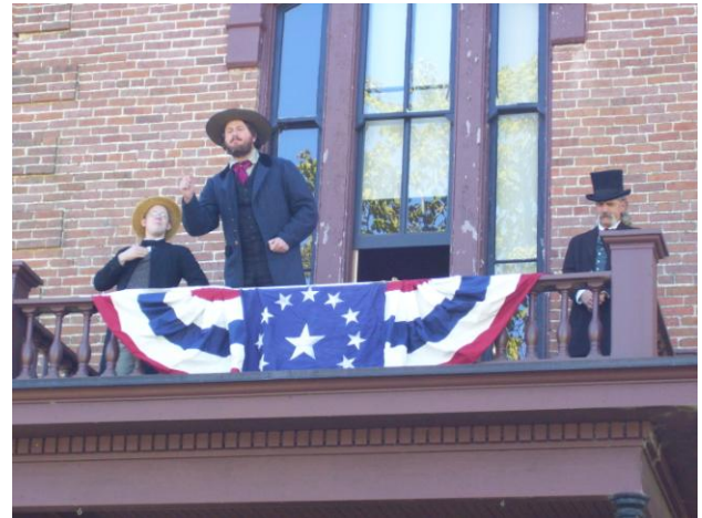
1860 Election Campaign Event at Historic Washington State Park leading up to the event of Secession in Little Rock on May 6, 1861.

At 3 pm on the afternoon of May 6, 1861, the Arkansas Secession Convention reconvened in the House of Representatives chamber of the State House in Little Rock. Earlier in the day they had commissioned a committee to draw up an ordinance to end Arkansas's ties to the United States of America. The committee's work now done, the crowded chamber listened closely to the arguments for political separation expressed in the document. A last ditch effort to postpone secession was attempted by the staunchest of Union men, and an amendment was offered to schedule an earlier date for the statewide vote on secession the convention had agreed to in March. This failed, though, and without any debate the roll was called. Passage of the ordinance was now a forgone conclusion, and the Secessionist delegates felt no need to say anything more. A few of the leaders of the pro-Union delegates took it upon themselves to explain why they were now voting for secession. At the end of the roll, sixty-five delegates had voted for secession while five had stood against it. David Walker, elected a Unionist