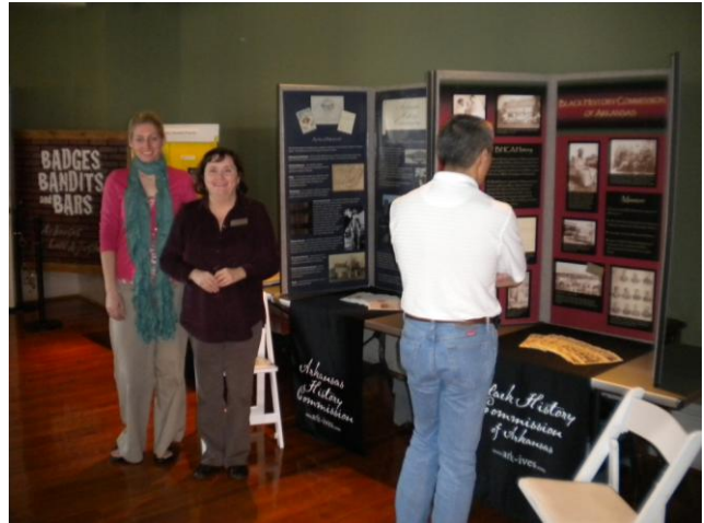
Representatives from the Arkansas History Commission are part of the Vendor Area during the 2011SEALHFAM Conference.