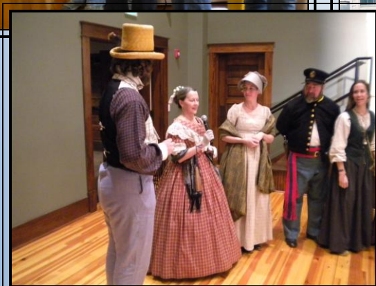
(Right) Living Historians show off their "wears" at the 2011 Conference