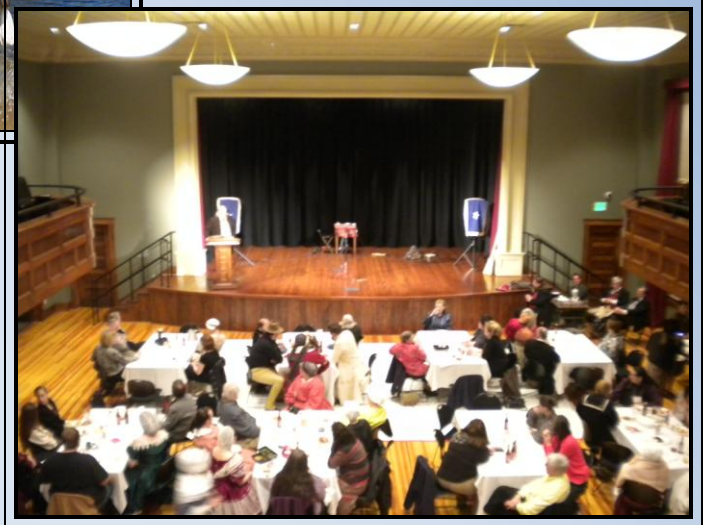
(Right) Evening Awards Banquet at the SEALHFAM Conference in Little Rock