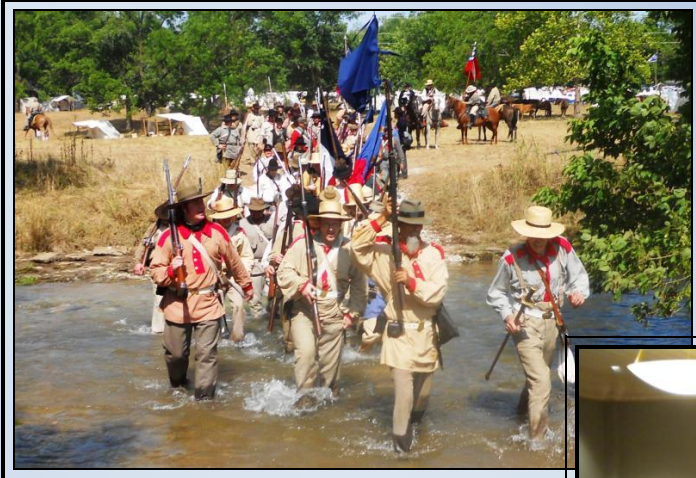
(Above) ALHA Members attend the 150 th anniversary of the Battle of Wilson's Creek