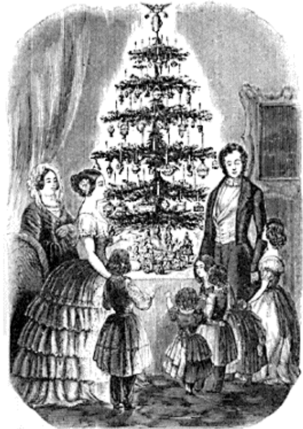
Queen Victoria and Prince Albert made Christmas Trees popular in England and America. The first trees were placed on tables.

Christmas was not a celebration though, that encompassed the whole month of December. When you look through the local newspapers during the early nineteenth century Christmas is not mentioned