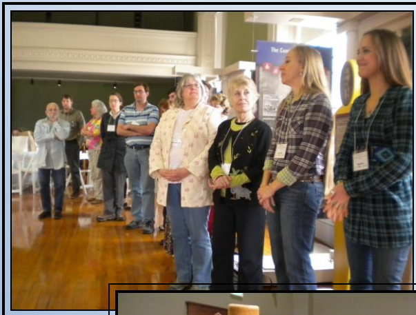
(Left) ALHA Members are recognized for their ALHA Certification. (Below) Tulip Academy winner of 2010 Outstanding Living History Event